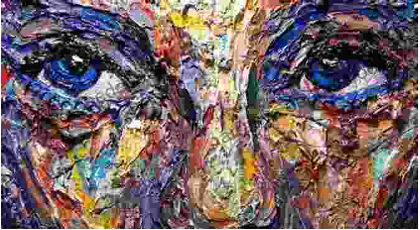
Joy Ronan Hession, Sculpture (2016),bronze