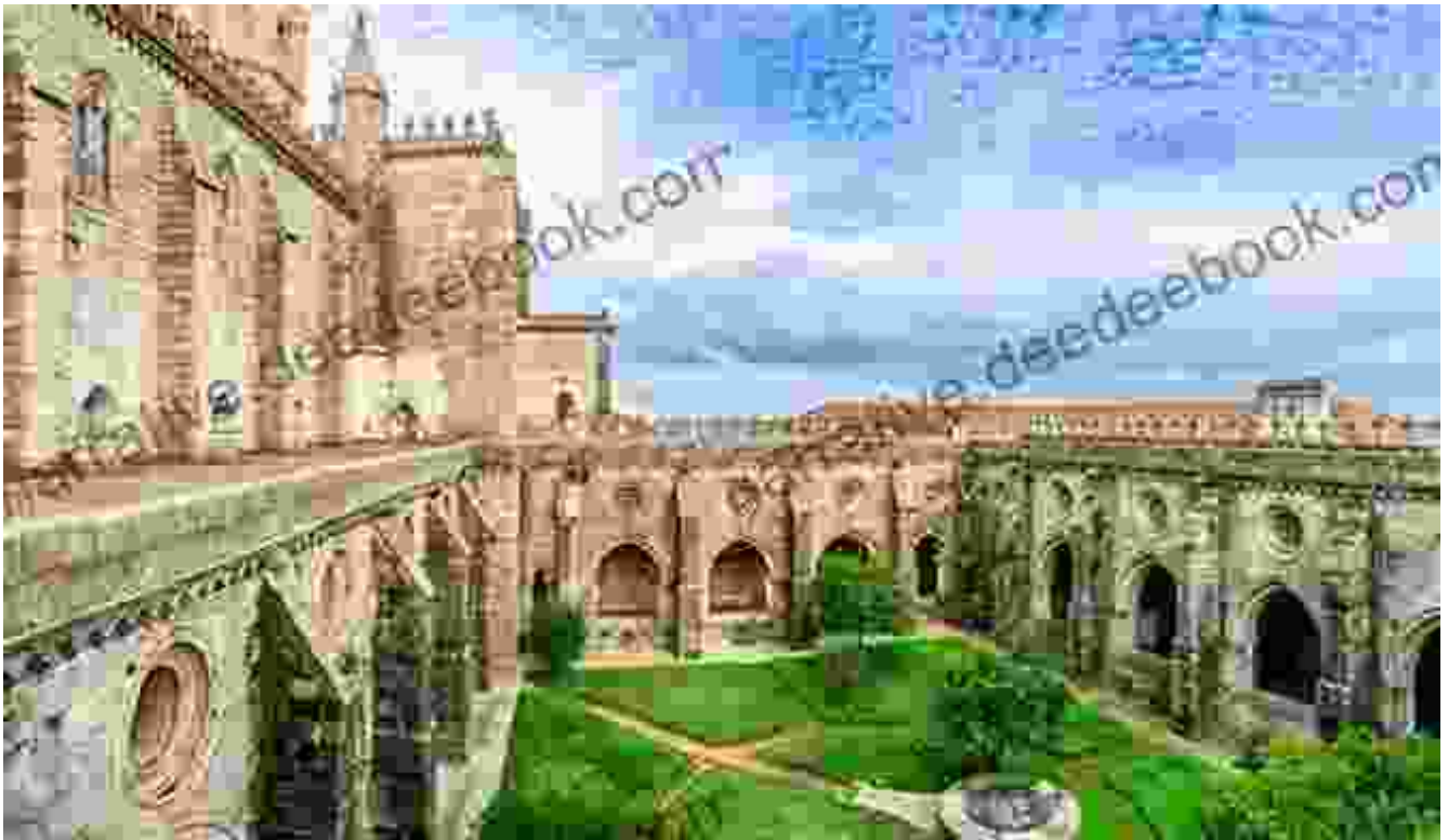
Evora is a historic city in Portugal that is known for its well-preserved Roman ruins.