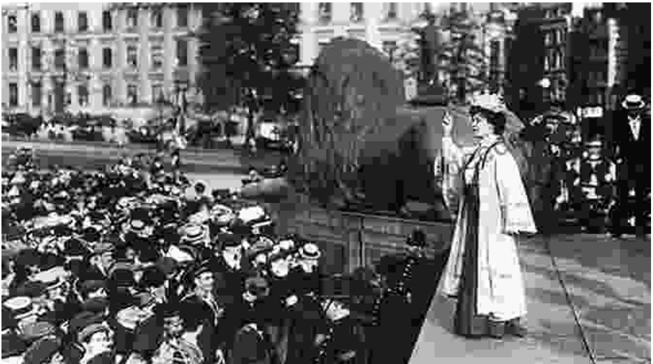
A suffragette addressing a crowd in support of women's voting rights.