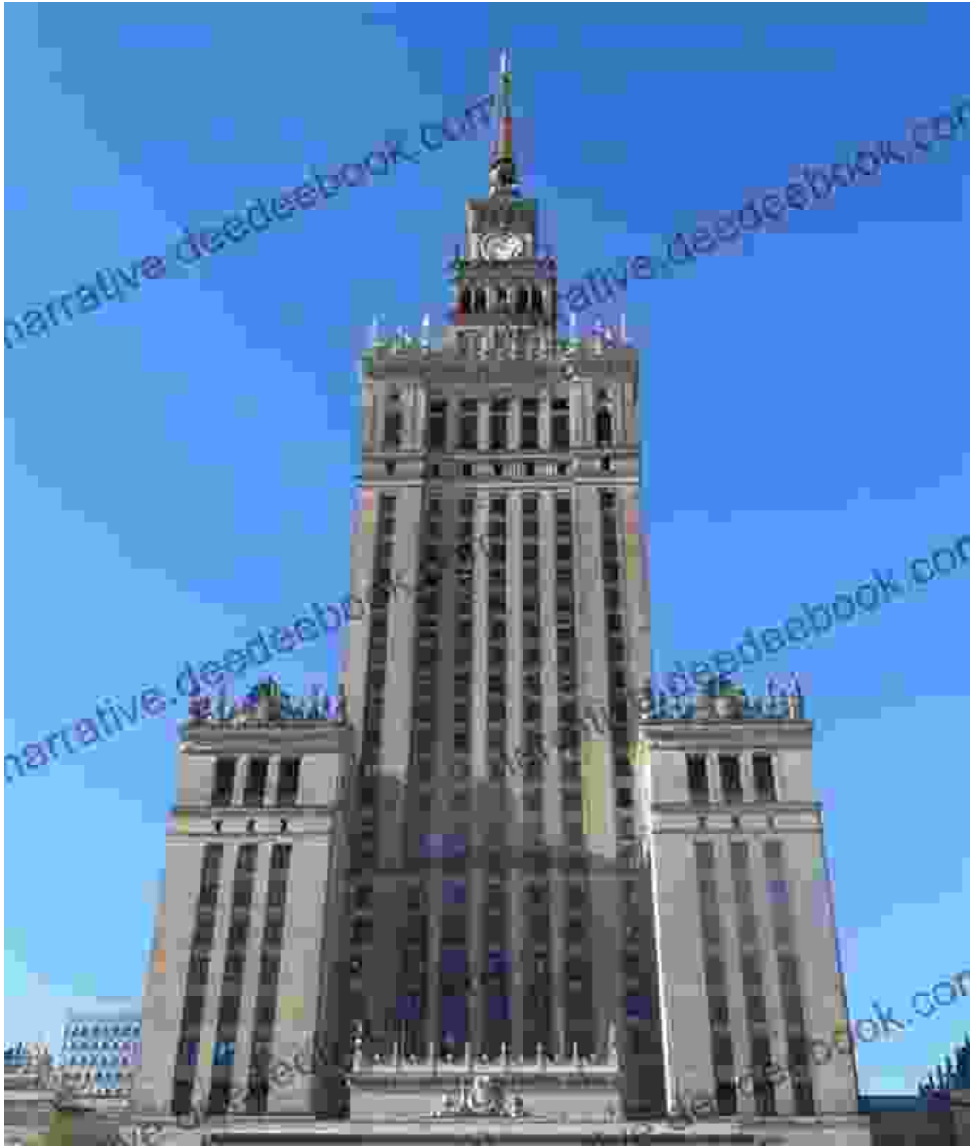
Palace of Culture and Science, Warsaw

We pay tribute to the heroic Warsaw Uprising of 1944, a valiant but ultimately doomed struggle against Nazi occupation. The Warsaw Uprising Museum provides a poignant account of this pivotal event.