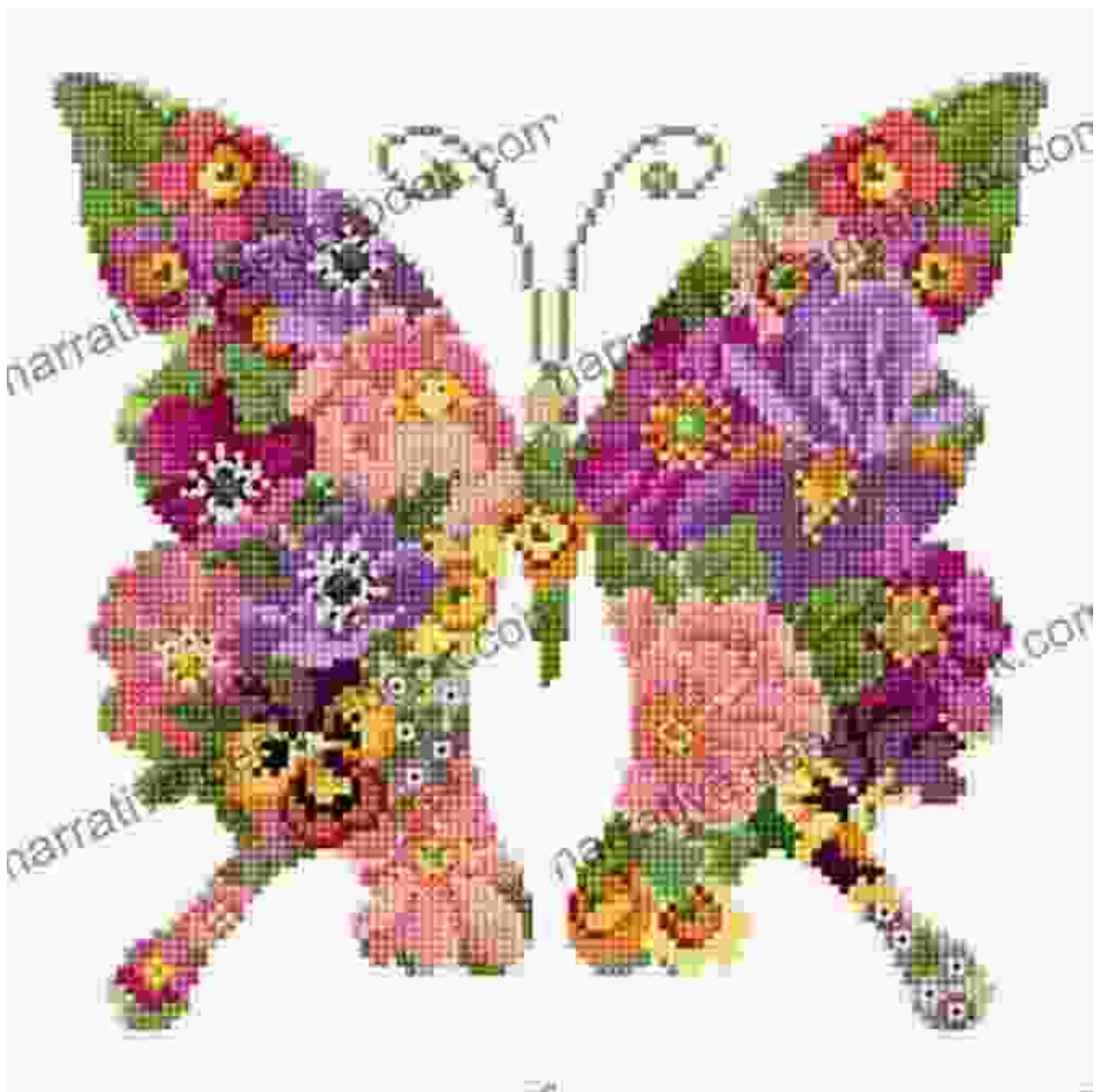
Floral Backdrop in Butterfly 10 Cross Stitch Pattern by Mother Bee Designs